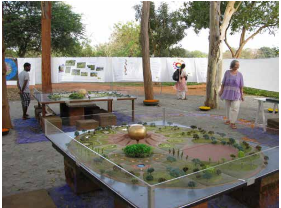
The Garden Exhibition space set up near the Matrimandir office.