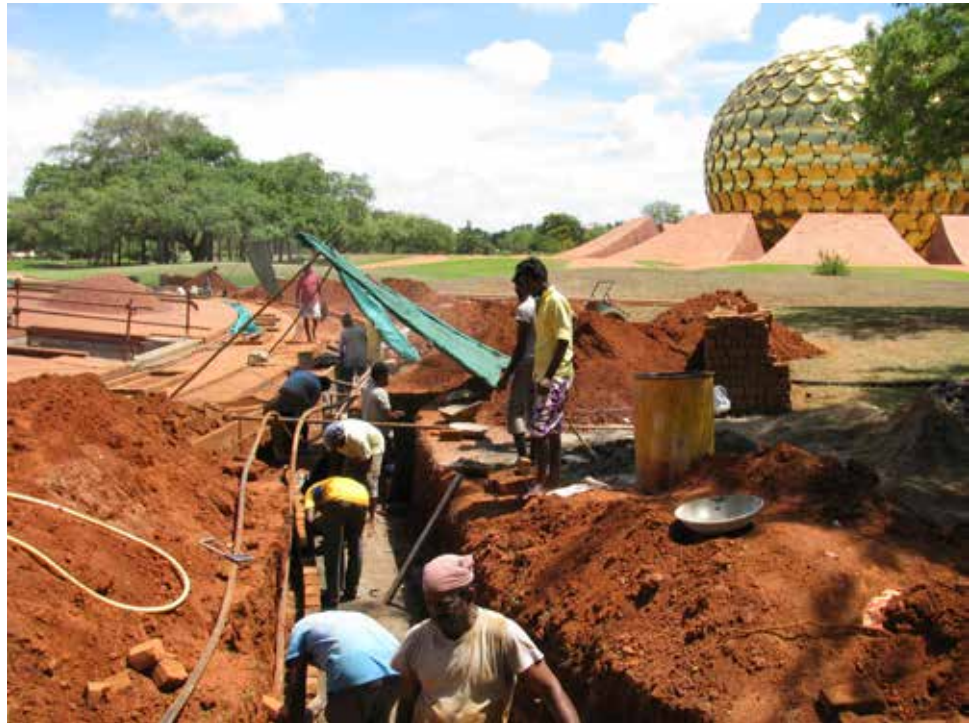
Cable ducts are being built beside the Amphitheater as a part of the work to shift the main panels out of the Amphitheater's underground room

One of these aspects is the need for an underground space for performers to prepare themselves,- to put on costumes, to prepare for their appearance in the amphitheater. We envisage more and more usage of the amphitheater for such quality programs in the coming years. Thus this space is being now completely overhauled. The large electrical panels, which still distribute all the electrical energy needed within the site, are being shifted out from their underground room to a location next to our solar plant, situated a few hundred meters to the South, outside of the boundary of the isolating zone ( or future lake) which is to surround the gardens oval.