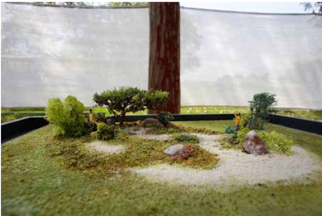
A model of a detail of the garden of Youth.

On March 31st, a slide presentation of the proposal was made to a community gathering in the Cinema Paradiso hall, close to the Matrimandir compound. At the time of writing, we are now gathering community feedback to these proposals, and considering how to organize the immense work that lies ahead,- to plan in detail the many steps needed to translate the design concepts now in hand down into reality on the ground. It is quite an adventure, and one that we hope we will be able to dive fully into during the months ahead.